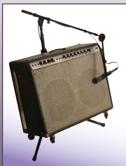
RS7500 and MSA7500CB shown with amp and mic set-up.