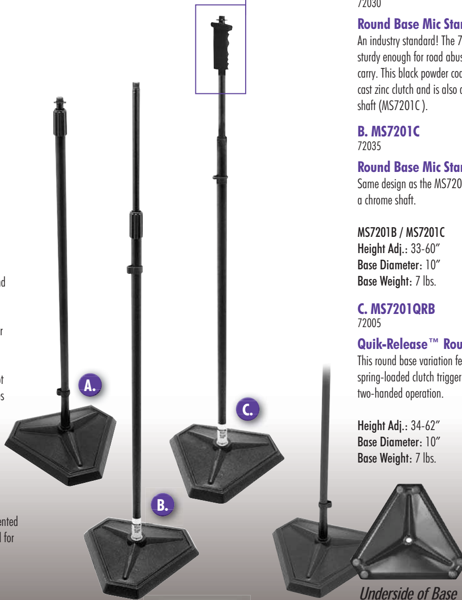
Underside of Base

Our patented HEX-BASE® is constructed from 9 lbs. of sheet metal and is designed to eliminate movement when the user steps on the base for unwavering support.